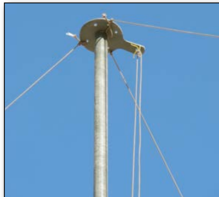
Guy Ring and lanyard detail

Attached at a corner mast, the feed line details show the lanyard pulley attached to the feed line / loop support point